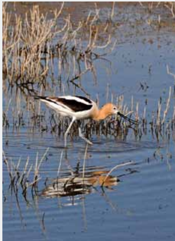
American Avocet, June 2011

Submit your own photos taken in the lagoon! Send as an attachment with a description and your name in the subject line to photos@sanelijo.org