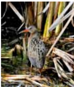
A Clapper Rail in the lagoon, September 2011

Comparison of the 1973–83 and recent data show that over the last four decades species richness has increased, while overall abundance has declined. "The lagoon has hosted the successes of an impressive number of threatened and endangered species; on the other hand, presence has experienced a comparative decline among non-threatened species," Kennedy writes. She attributes the declines in overall abundance to edge effects from encroaching development around the reserve, as well as in other locations along the birds' migratory path.