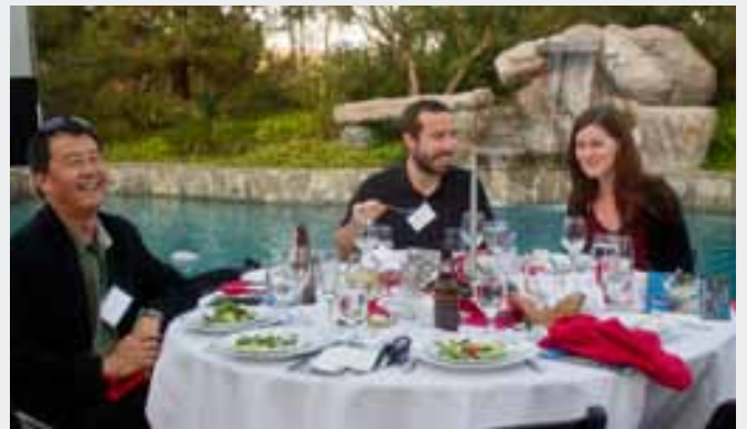
2011 Birds of a Feather Gala guests enjoy dinner by the pool.